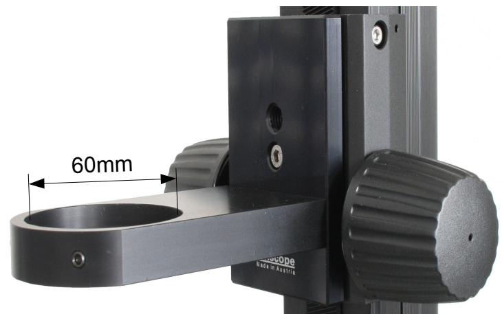
Solid lens holder