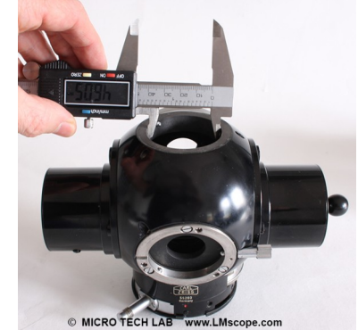
Zeiss photo tube