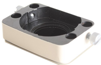
SZ-series photo port